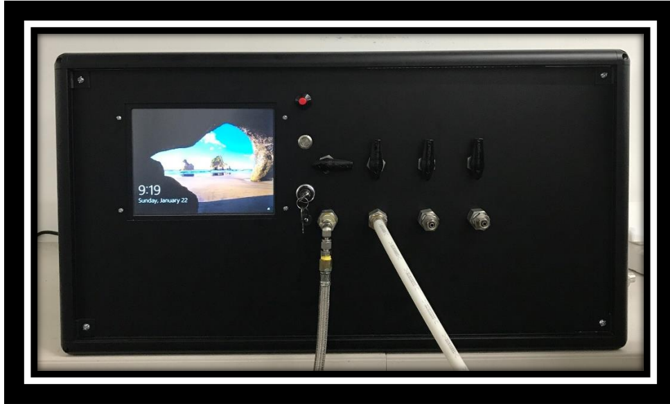
TDSSe or TDSSg (Front of either system)

Options include solar panel battery charging, two (2) lithium-ion batteries powered by thermal electric generators and the ability to control system operations from a host vehicle (12/24 volts VDC).