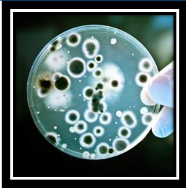
Above: Bacteria & Viruses in Drinking Water 1